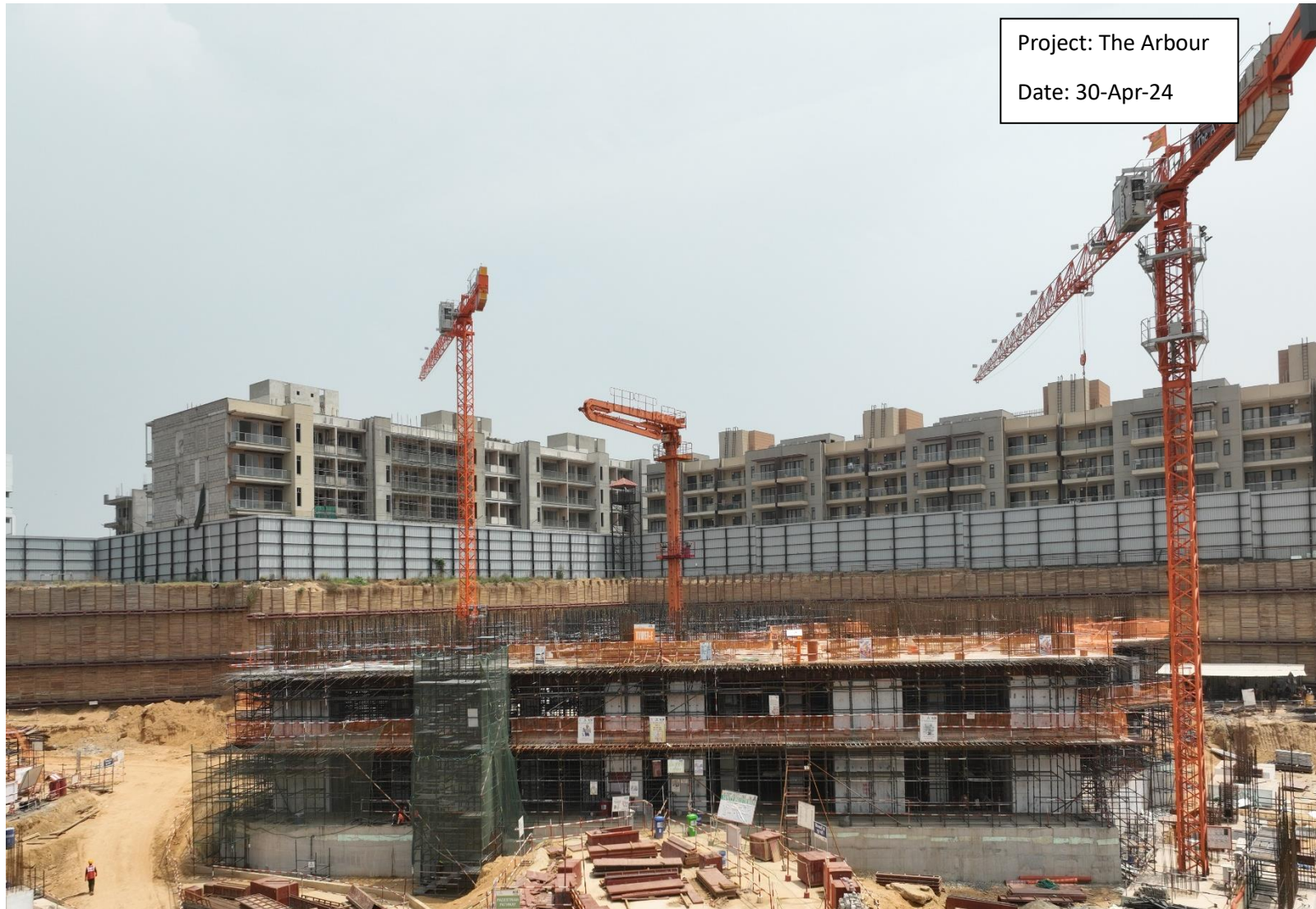
Tower E – B2 Floor Slab completed, B1 level WIP