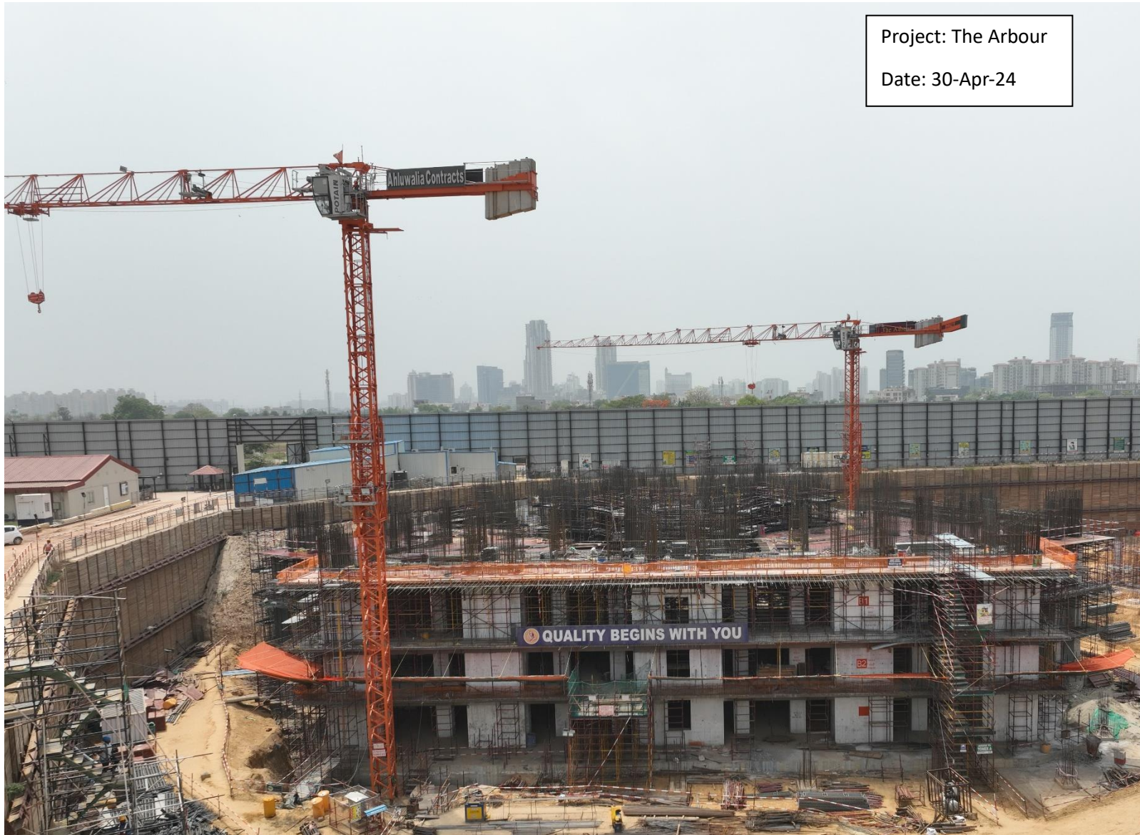
Tower A – B1 Floor Slab completed, GF level WIP