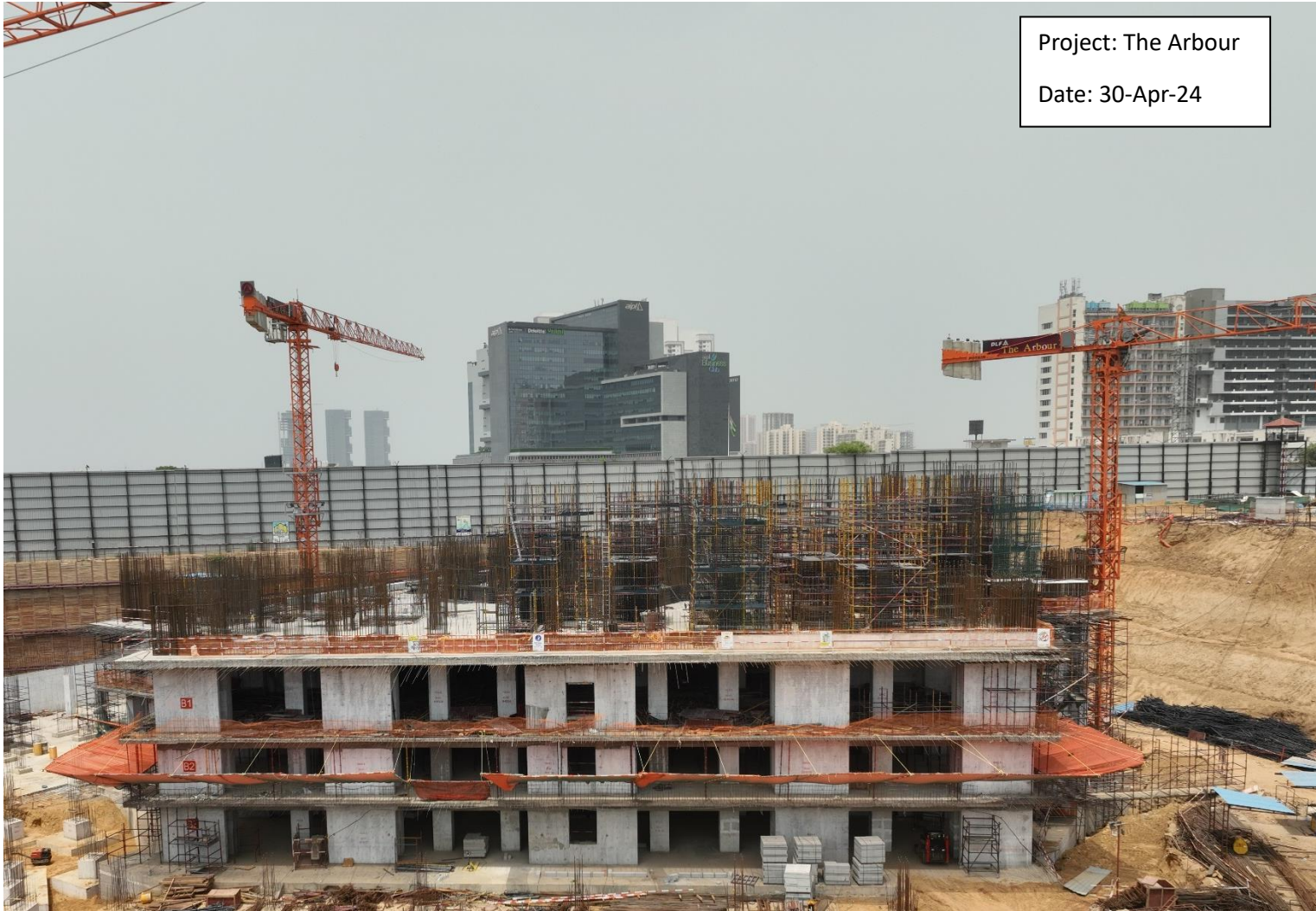
Tower C – GF Slab completed, 1F level WIP