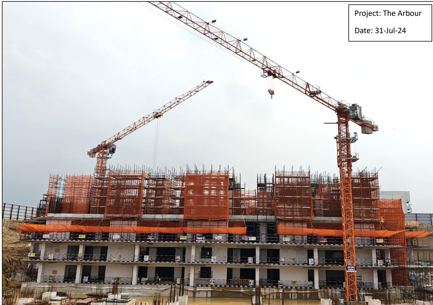
Tower D – GF Slab completed, 1F level WIP