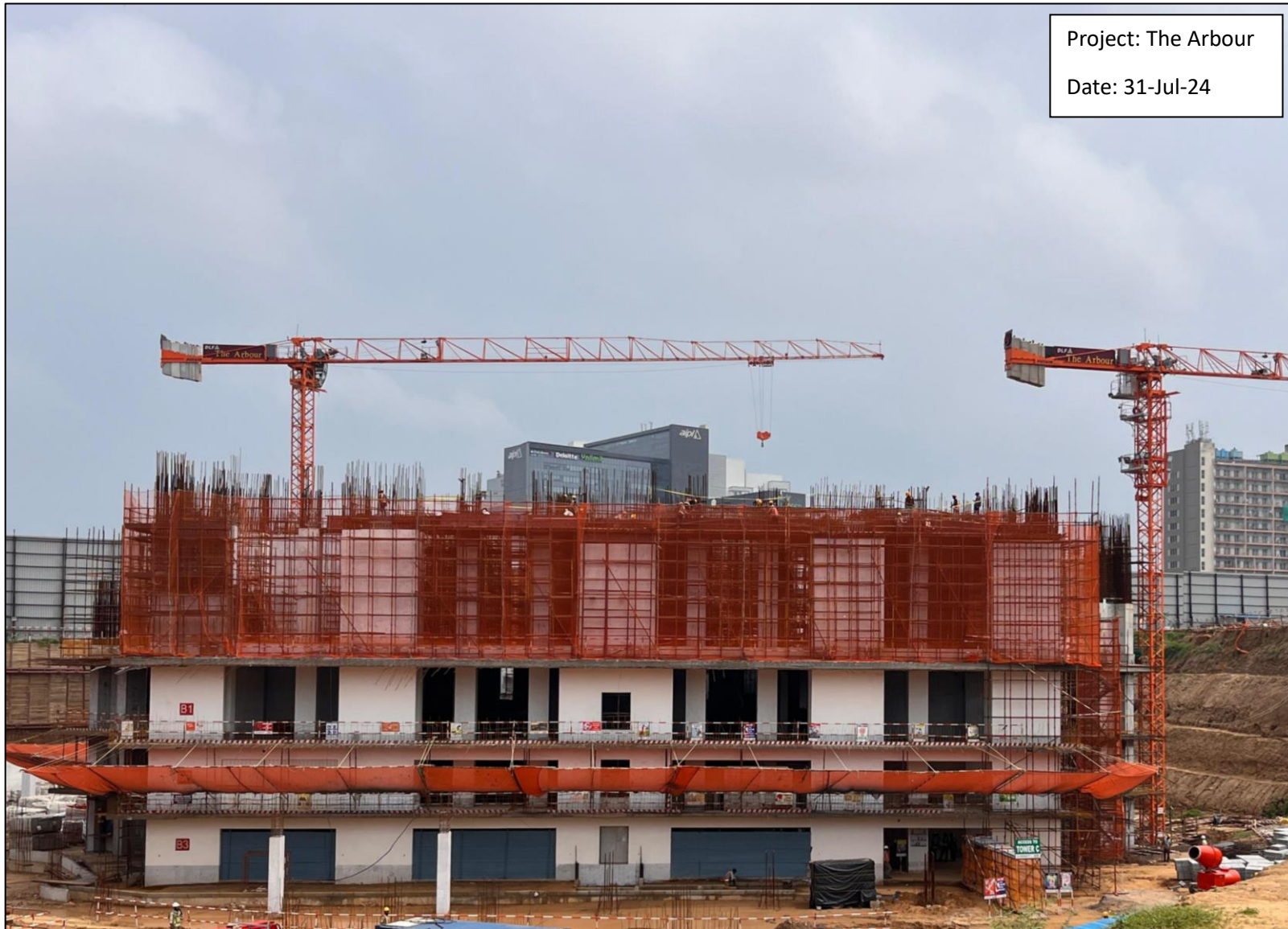
Tower C – GF Slab completed, 1F level WIP