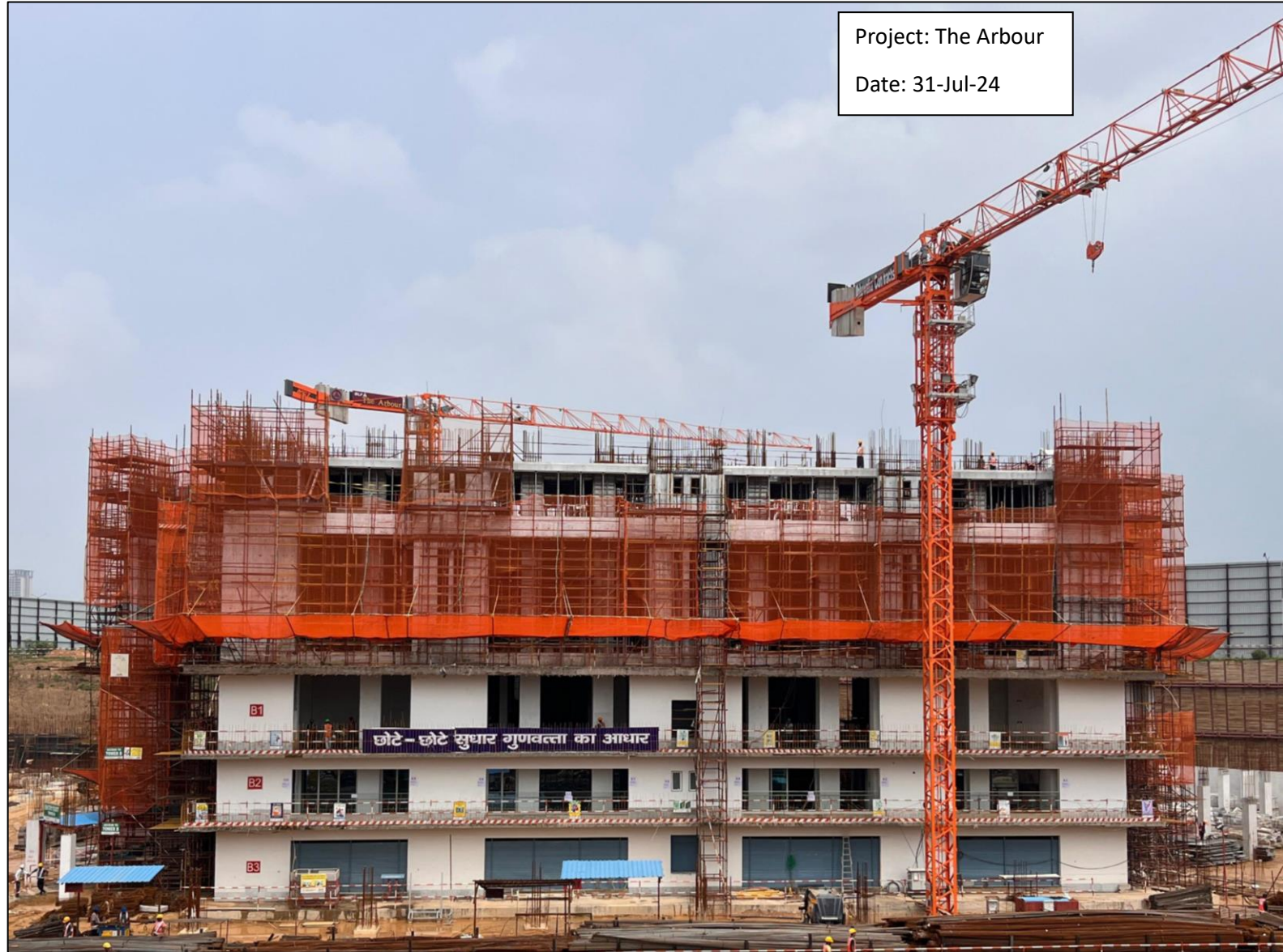
Tower B – GF Slab completed, 1F & 2F WIP