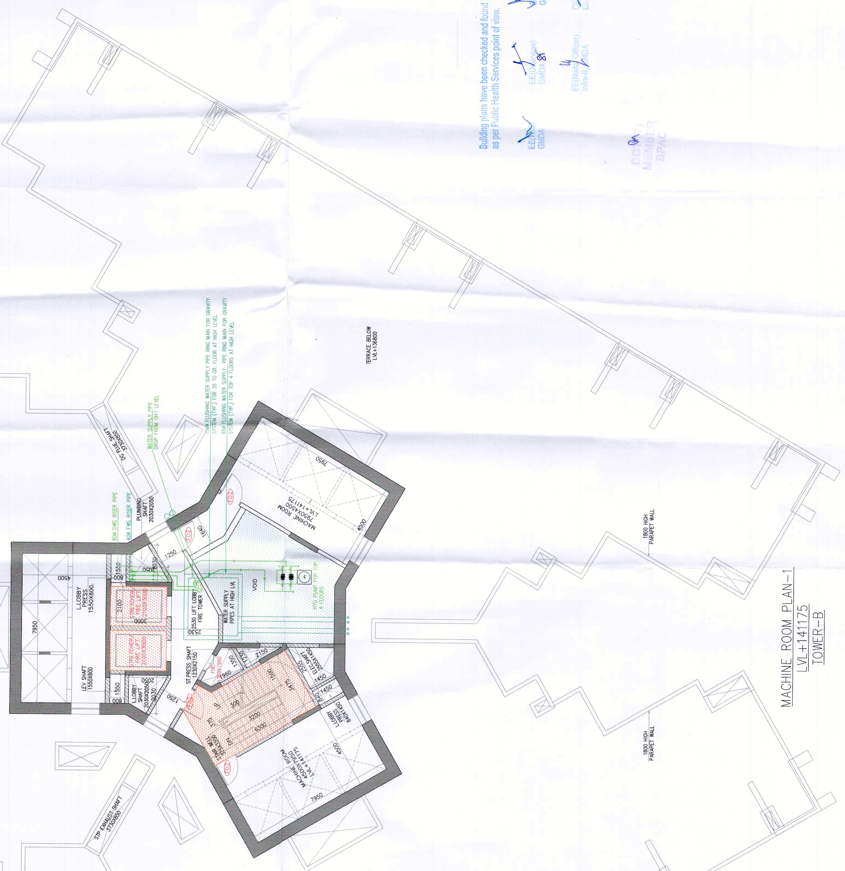
MACHINE ROOM PLAN-1 LVL-141175 TOWER-B